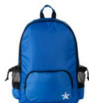
RAVEN BACKPACK $57.50