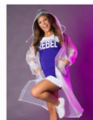
REBEL RAINCOAT $15.00