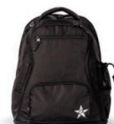
STRIKE DREAM BAG $76.50