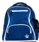
CHOOSE FROM ANY IN-STOCK DREAM BAG WITH $113 MSRP $99.00